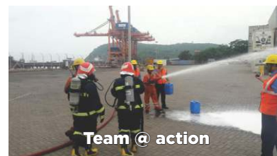
Team @ action

were rushed to respective safe assembly points. The Fire and Rescue Squad (FRS) members rushed to the incident site with the emergency equipment. The fire hoses were rigged up and the FB(5X) foam connection was used to generate foam for fighting the fire. Water spray was generated at the other end to ease in containment of heat generated due to the fire and cooling down the adjacent equipment in the near vicinity. One personnel from the FRS fell unconscious due to heavy heat exposure and exhaustion. He was immediately assisted by the Medical Team and sent to First Aid Centre for further medical assistance. The fire was brought under control at 1249 hrs. Immediately a team donning Fire suits and SCBA set were deployed to check the situation and assess the damage due to the fire incident. The drill was called off at 1259 hrs and the emergency teams were de-briefed.