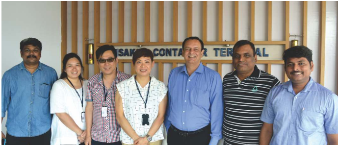
Team from Seeds Intimate India Pvt. Ltd., along with K.S.R. Freight Forwarders (P) Ltd., visited on 05.09.2015