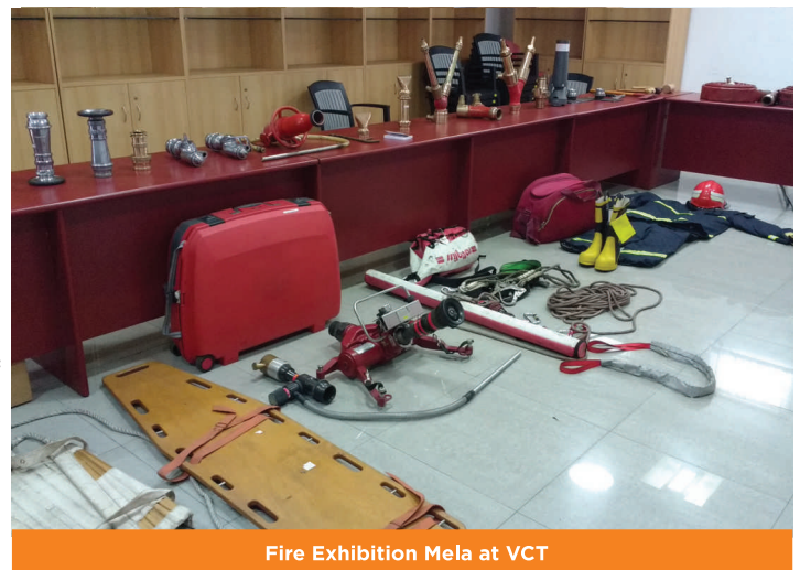
Fire Exhibition Mela at VCT

A Fire Mela was organized in the terminal's Training Centre for creating awareness among VCT and contract employees on the availability and use of the fire equipment in VCT. Live fire drills were conducted as part of training for the fire wardens. A mock drill was also organized on fire scenarios. Key personnel of the terminal as per the onsite emergency plan and the Fire and Rescue squad immediately reacted to control the mock situation using the firefighting equipment available in the premises. Other programmes included radio quiz and poster making competition.