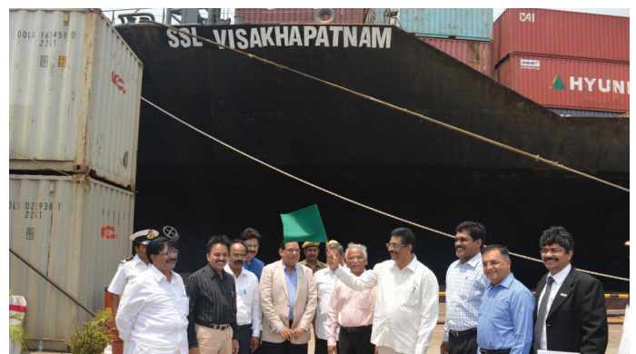
Honourable Member of Parliament (Lok Sabha), Shri K Haribabu flagging-off maiden voyage of SSL VISAKHAPATNAM

Honourable Member of Parliament expressed his pride in Visakhapatnam Port receiving a vessel named after the City and conveyed how its prominence has grown over the last decade in International Forum. He reckons the city has gained momentum post bifurcation of state and its International connectivity through sea and air has increased too. The logistics connectivity to the city and state's over 900 km coastline is the base for Vizag to turn into a Logistics Hub and to create the Port led development. He also emphasised that A.P being rich in agriculture, all the commodities that are grown here have immense export potential and the rapid industrialisation that is anticipated in the years to come would only further encourage such new services to be deployed from Vizag.