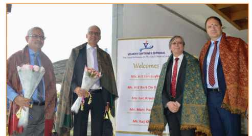
The delegation @ VCT