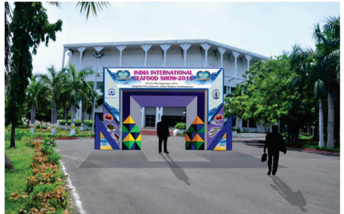
20 th IISS @ Port Trust Diamond Jubilee Stadium, Vizag.

The theme of the event is “Safety & Sustainable Aquaculture” . The country's Sea Food Exports during 2015 – 16 was at $ 4.7 billion and now targeting to reach $ 10 billion by 2020. Vizag plays a vital role with high number of Sea Food Exports from its hinterland through VCT where majority of the products gets exported to United States followed by Europe, Haiphong, Japan and others. The port city is known for marine product exports that topped in two consecutive years 2013 – 14 & 2014 – 15 in terms of dollar value. To reach the target of $ 10 billion, Vizag's contribution is immensely crucial. Considering the huge potential in the region, this show will be the right platform for many collaborations and huge investments laying the path for greater sea food exports through VCT.