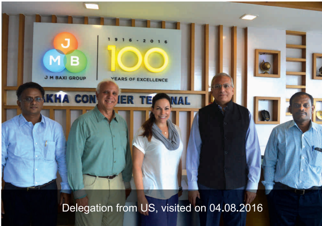
Delegation from US, visited on 04.08.2016