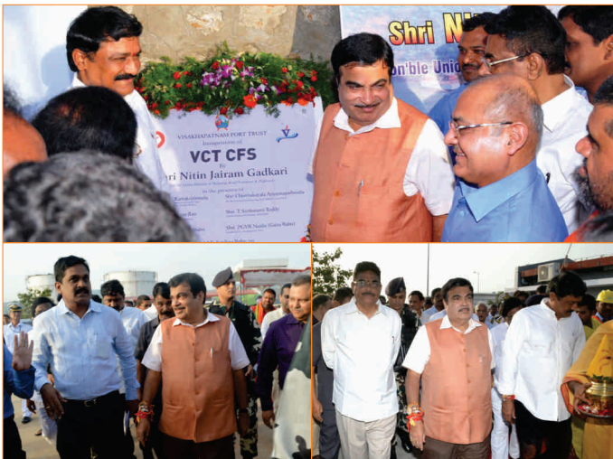
VCT CFS Inaugurated by the Hon'ble Union Minister of Shipping, Road Transport & Highways

Visakhapatnam's state-of-the-art container freight station, VCT - CFS was inaugurated on 18 August, 2016 by Shri Nitin Jairam Gadkari, Hon'ble Union Minister of Shipping, Road Transport & Highways in the presence of other noted dignitaries & ministers that included Shri Ganta Srinivasa Rao, HRD Minister, Shri Sidda Raghava Rao, Transport, Roads and Buildings Minister, Shri K. Haribabu, MP along with other MPs and local MLAs.